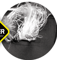
RAPID PULL OUT ON IMPACT